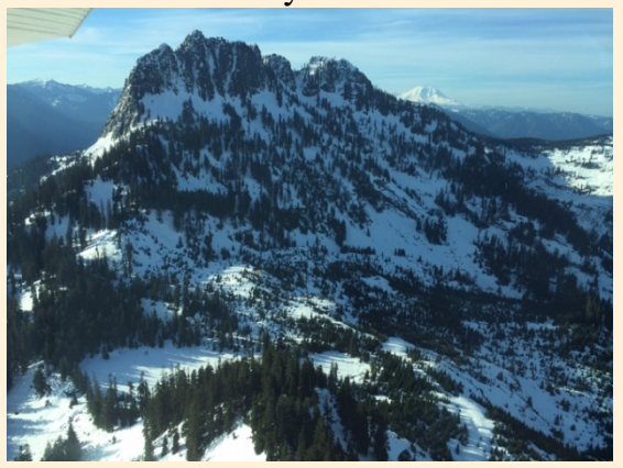
Photo 1. A gorgeous day for a low altitude flight. Note Mt. Rainer in the distance on the right.

I think of the many other types of evaluations I conduct. For example, on another day, I might be called to testify as an expert or fact witness in court. Though I enjoy the work involved with forensic evaluations, it is serious work that requires careful and unbiased testimony.