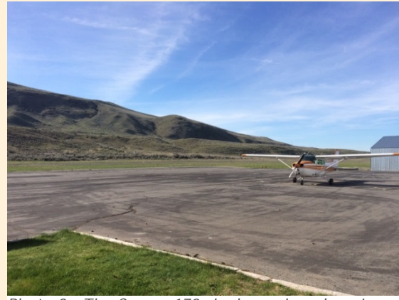
Photo 2. The Cessna 172 single-engine plane I rode to the destination "airport."

Perhaps you are wondering what is involved in pursuing a career as a clinical psychologist? First and most obvious, there is the completion of a doctoral training program, which includes a mandatory 12-month full-time doctoral internship component. Doctoral internship candidates are competitively placed via the